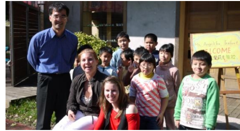
With the students of the Elementary School

The media was present everywhere, I gave a couple of interviews and was impressed when the children of an elementary school who gave a great show for me, were told to watch TV the next day to see me ride. No matter where we went, the warm welcome of the Taiwanese people was overwhelming.