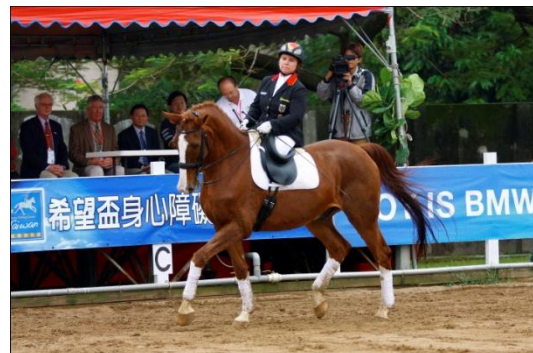
With Java at the ThRCT's Hope Cup